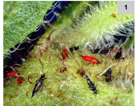
Liothrips tractabilis adults (black) and nymphs (red)

On 18 June 2013, permission was granted by the South African Department of Agriculture, Forestry & Fisheries (DAFF) to release the stem- and leaf-deforming thrips ( Liothrips tractabilis ) from quarantine at ARC-PPRI Cedara, for the biological control of pompom weed ( Campuloclinium macrocephalum ). The thrips, which originates from Argentina, was first imported into quarantine in March 2005. Over the years the thrips was tested by staff at Cedara for specificity and damage to pompom weed. Adult and nymphal stages of the thrips ( photo 1 ) feed on pompom stems and leaves, which in turn drastically deforms plant growth ( photos 2 & 3 ), so reducing flowering. After seven years of research, a release application was submitted to DAFF in June 2012.