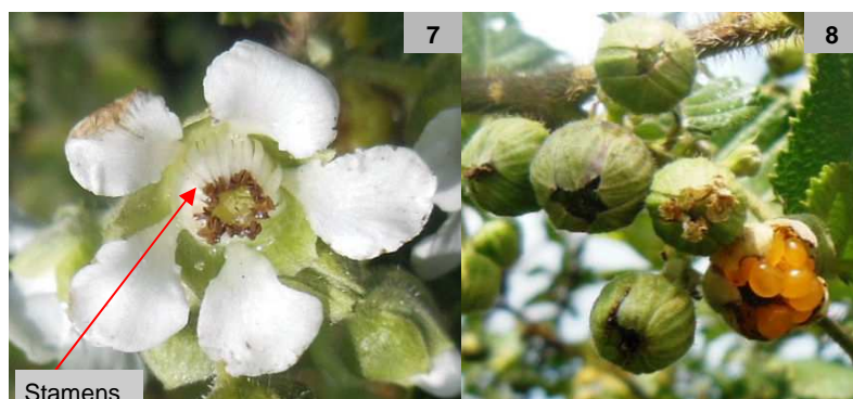
Yellow Himalayan raspberry

Flowers are predominantly white; stamens with broad, flattened filaments, in a compact circular arrangement (photo 7) . Raspberry-type fruits are yellow when mature (photo 8).