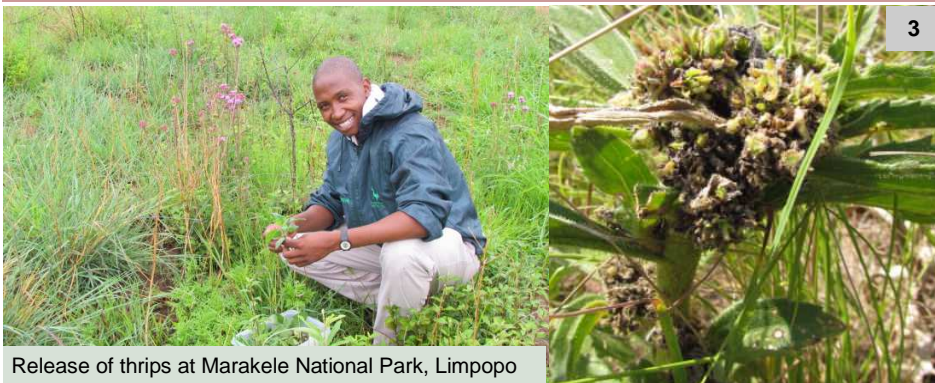
Release of thrips at Marakele National Park, Limpopo

The pompom thrips, in conjunction with the pompom rust ( Puccinia eupatorii ), chemical control and remedial land management approaches, will reduce the spread and impact of this invasive plant going forward. Thanks must go to the Working for Water Programme for funding this programme since inception.