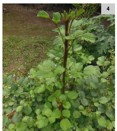
Young plant with red bristles on stems