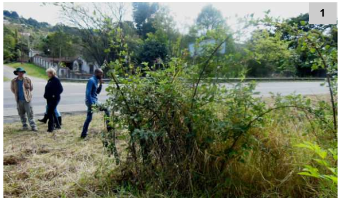
Mature plant with stout, arching branches

How to recognise it... It has scrambling arching branches (photo 1), and due to its stout robust stems, plants can grow much taller than other Rubus species.