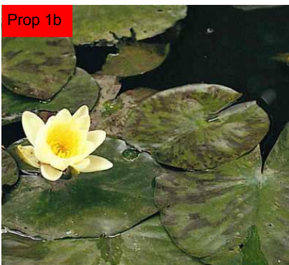
Nymphaea hybrid water lily , petals rounded, pale yellow