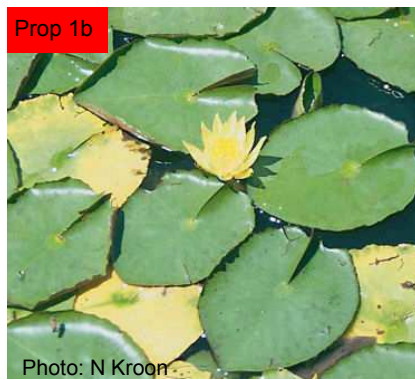
Nymphaea mexicana, yellow water lily , petals pointed, deep yellow; invasive on Vaal River.