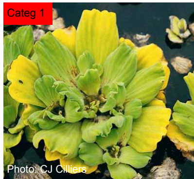
Pistia stratiotes , water lettuce