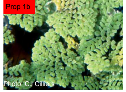
Azolla pinnata subsp. asiatica , Asian mosquito fern, leaves mostly not overlapping; branching regularly pinnate; prefers tropical areas (coastal KZN)

Indigenous Azolla pinnata subsp. africana , known only from Ndumu in KwaZulu-Natal, has more pointed leaves than A. filiculoides and A. microphylla , a regular pinnate branching pattern giving a 'Christmas tree' shape, and delicate lateral roots. A. pinnata subsp. asiatica differs from subsp. africana by leaves that only closely overlap towards the branch tips and a narrow transparent leaf margin. A. microphylla (= A. mexicana ) has recently been confirmed in South Africa through molecular analysis (pers. comm. Martin Hill).