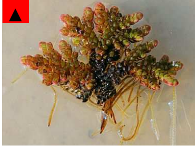
Azolla microphylla , tropical red water fern, leaves and branching pattern similar to A. filiculoides ; prefers tropical areas e.g. lowveld of Limpopo & Mpumalanga