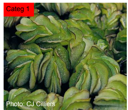
Salvinia molesta , salvinia