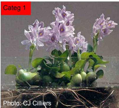
Eichhornia crassipes , water hyacinth