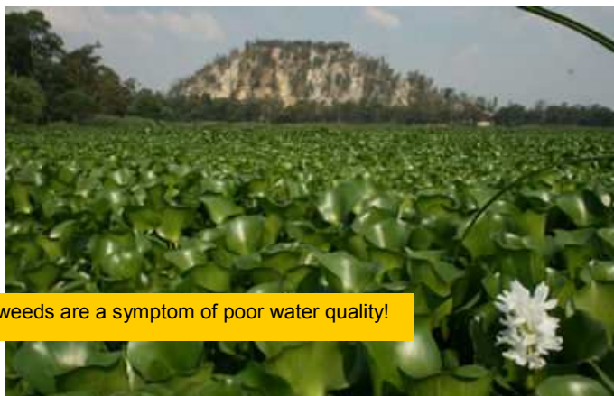
Aquatic weeds are a symptom of poor water quality!