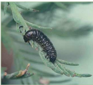
Feeding damage to parrot's feather ( Myriophyllum aquaticum ), by the leaf-chewing beetle, ( Lysathia sp.)

Biological weed control is the use of natural enemies to reduce the vigour or reproductive potential of an invasive alien plant. The principle is that plants often become invasive when they are introduced to a new region without any of their natural enemies. The alien plants therefore gain a competitive advantage over the indigenous vegetation, because all indigenous plants have their own natural enemies that feed on them or cause them to develop diseases. Biological control is an attempt to introduce the alien plant's natural enemies to its new habitat, with the assumption that these natural enemies will remove the plant's competitive advantage until its vigour is reduced to a level comparable to that of the natural vegetation. Natural enemies that are used for biological control are called biocontrol agents.