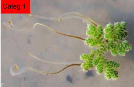
Azolla filiculoides , red water fern, leaves overlapping, branching irregular, whole plant ~ round in outline; root tips often coiled ; prefers cooler, highveld areas e.g. Free State