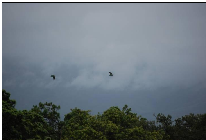
Figure 1. Cape Parrots flying over forest in October 2010. Unfortunately some observers see none on CPBBD but nil counts are also very important for accurate data analysis.

Reminder: Hopefully you have booked Saturday 7 th May and Sunday 8 th May 2011 to participate in our fourteenth Cape Parrot Big Birding Day (CPBBD). This year's count is particularly important if the Psittacine Beak and Feather Disease Virus (PBFVDV) outbreaks or PCD (Psittacine Circovirus Disease) as it is now being referred to, are widespread and seriously affecting the population. Please contact Prof Downs or one of the co-ordinators in your area. The CPBBD report for 2010 is available at http://biology.ukzn.ac.za/cpwg.html .