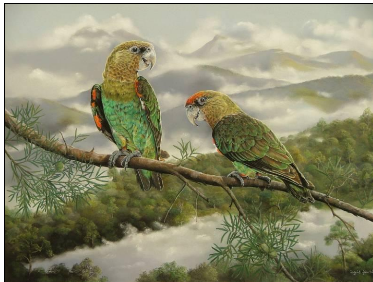
Figure 6. Ingrid Fouche's painting of Cape Parrots.

There are still reprints (size 60 x 45 cm, see below) of the Cape Parrot painting by Ingrid Fouche available. Cost R250.