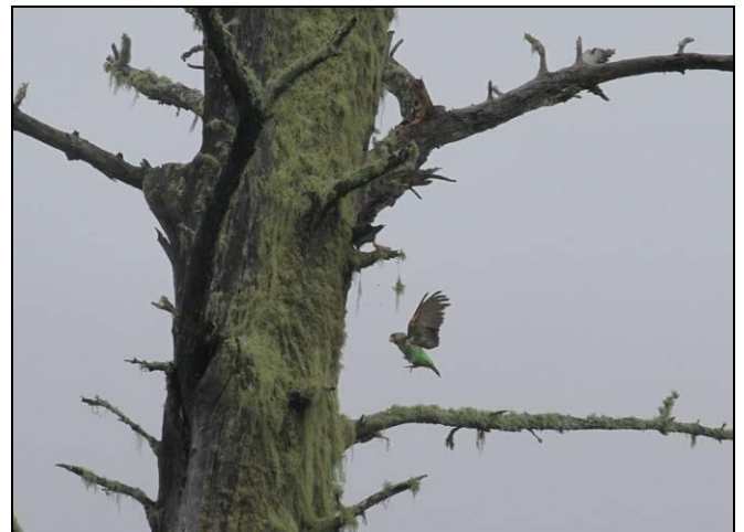
Figure 3. Cape Parrots nesting at Shire Eco Lodge, Stutterheim