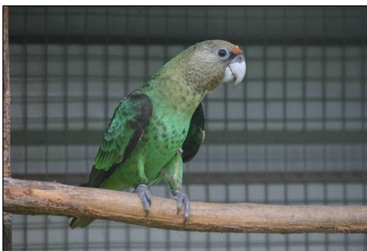
Figure 4. Female fledgling produced at Amazona breeding facility during September 2010.

The Cape Parrot is listed as a Threatened or Protected Species (TOPS) under the National Environmental Management Biodiversity Act 10 of 2004. As of 1st Feb 2008 all holders of Cape Parrots need to be registered and in possession of TOPS permits. Cape Parrots may not be moved anywhere within or out of the Republic of South Africa without written authorization from both Provincial and National Nature Conservation authorities. Provincial EXPORT & IMPORT permits strictly apply to the movement of Cape Parrots within the county.