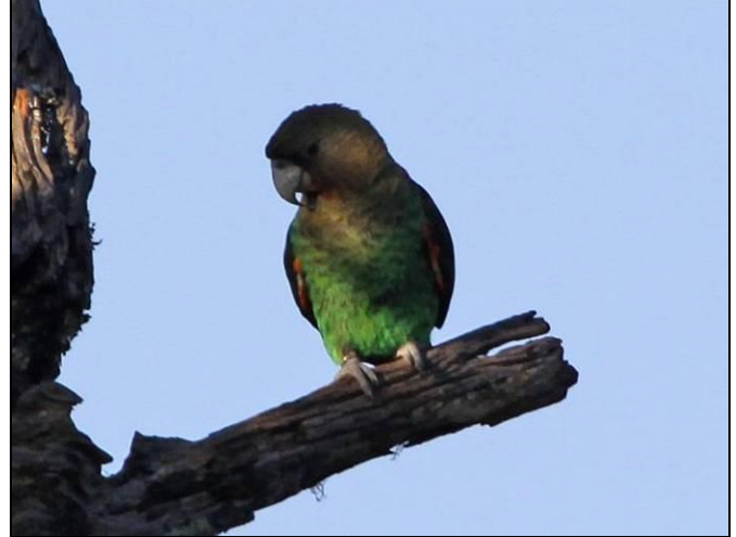
Figure 2. The wild Cape Parrot with a ring seen in November 2010. It had been ringed nearby as a nestling in October 2001.